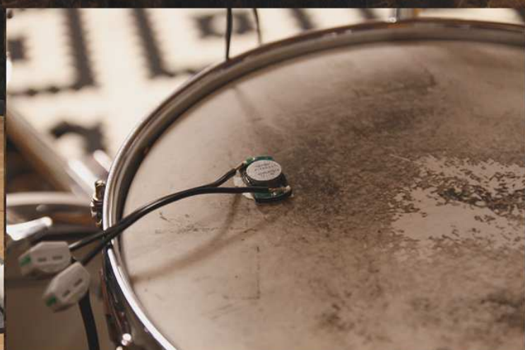
Some ethnic and orchestral drums & percussions like taikos, tom toms, tablas, wood and temple blocks, castanets etc. recorded with different types of sticks/mallets, pipes and combined with the multi mic positions.